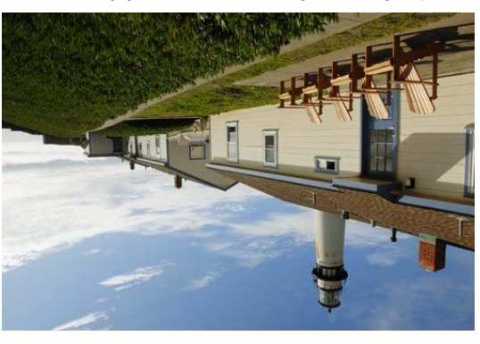
on a bluff overlooking the ocean. Our house at the Pigeon Point Lighthouse,

.to baid ban, (thgis on, knit and purl (and distinguish between the two by *At a minimum, all participants must be able to cast