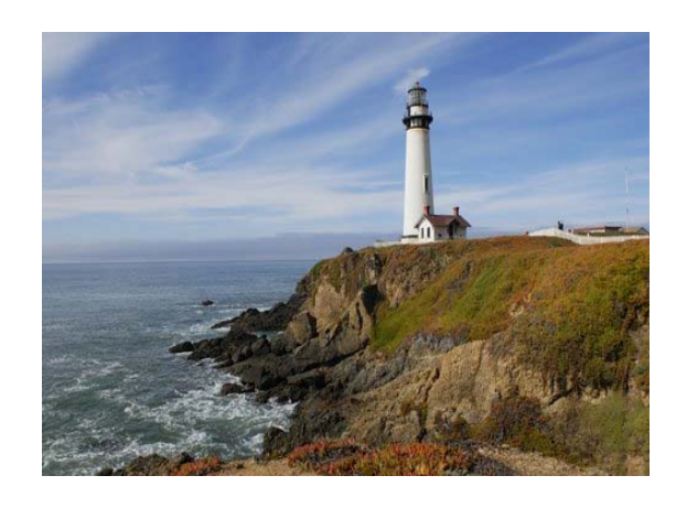
"The Pigeon Point Hostel tends to enchant its guests and destroy their will to leave." — The Berkeley Guides

A Knitting Retreat in Pescadero, California