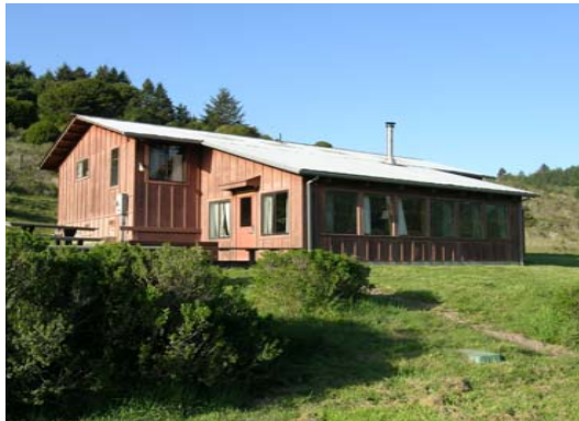
The Point Reyes Hostel Bunkhouse, nestled in a secluded valley close to the beach

During your free time, sit and knit, enjoy nature, practice your new skills, visit the Point Reyes Lighthouse or atmospheric towns nearby, check out the hiking trails, or just wander to the beach for a nap!