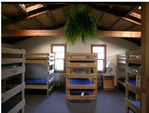
The San Francisco Chronicle calls the hostel "A warm country cabin style, in the heart of the Point Reyes National Seashore."

A cooperative spirit is an important component of the hostel experience. During the weekend, everyone will assist with daily cleaning chores, requiring about one half hour each day.